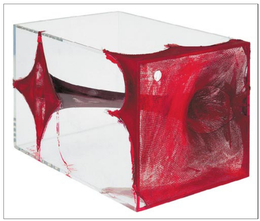
"Untitled" (2003) by Anish Kapoor

The exhibition rooms on the second floor of the Seoul Arts Center's Hangaram Art Museum in southern Seoul are crowded with paintings, photographs, sculptures, videos and installation works of relatively small sizes. The works are diverse in style but have one thing in common - they will all look strangely familiar to contemporary art enthusiasts.